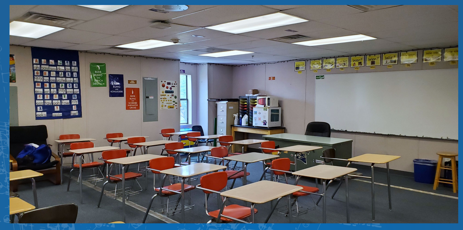
Typical Classroom Sandy Run Middle School, Upper Dublin School District