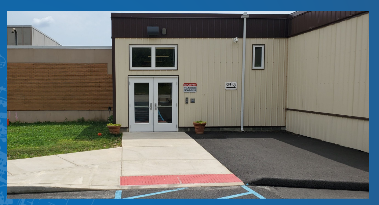
Exterior Building Connector